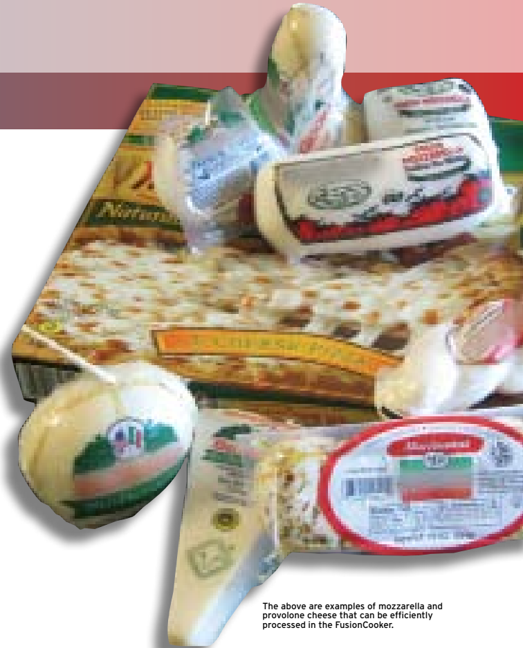
The above are examples of mozzarella and provolone cheese that can be efficiently processed in the FusionCooker.